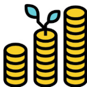
GSC Savings Accumulation Program