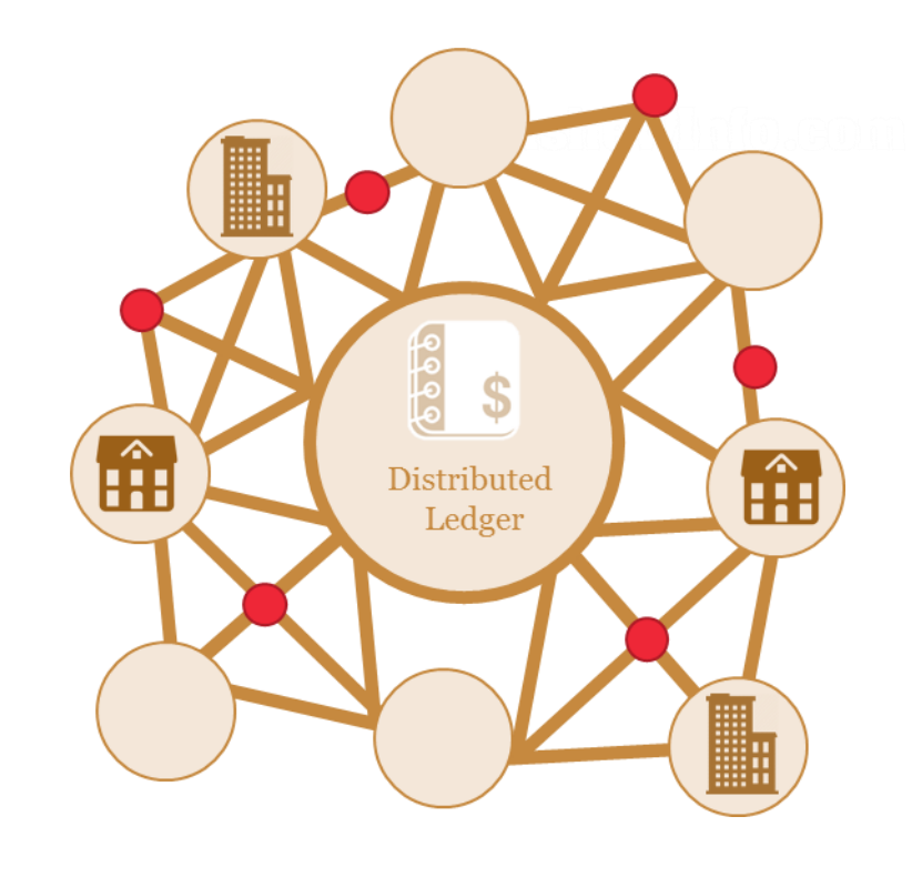
The Present Model