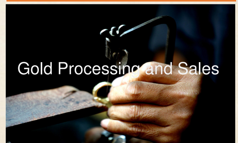
Gold Processing and Sales

Shenzhen Cuilu Jewelry Manufacturing Co., Ltd Beijing Cuilu Culture Development Co., Ltd Shenzhen Chuangdai Gold Culture Co., Ltd